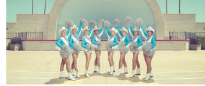
The Sun City Poms. Breadfield